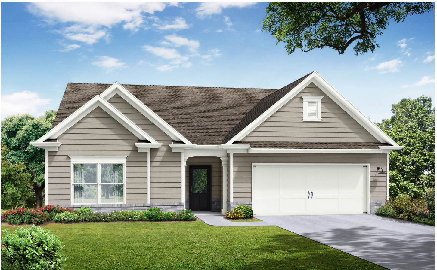
Elevation A (Standard)