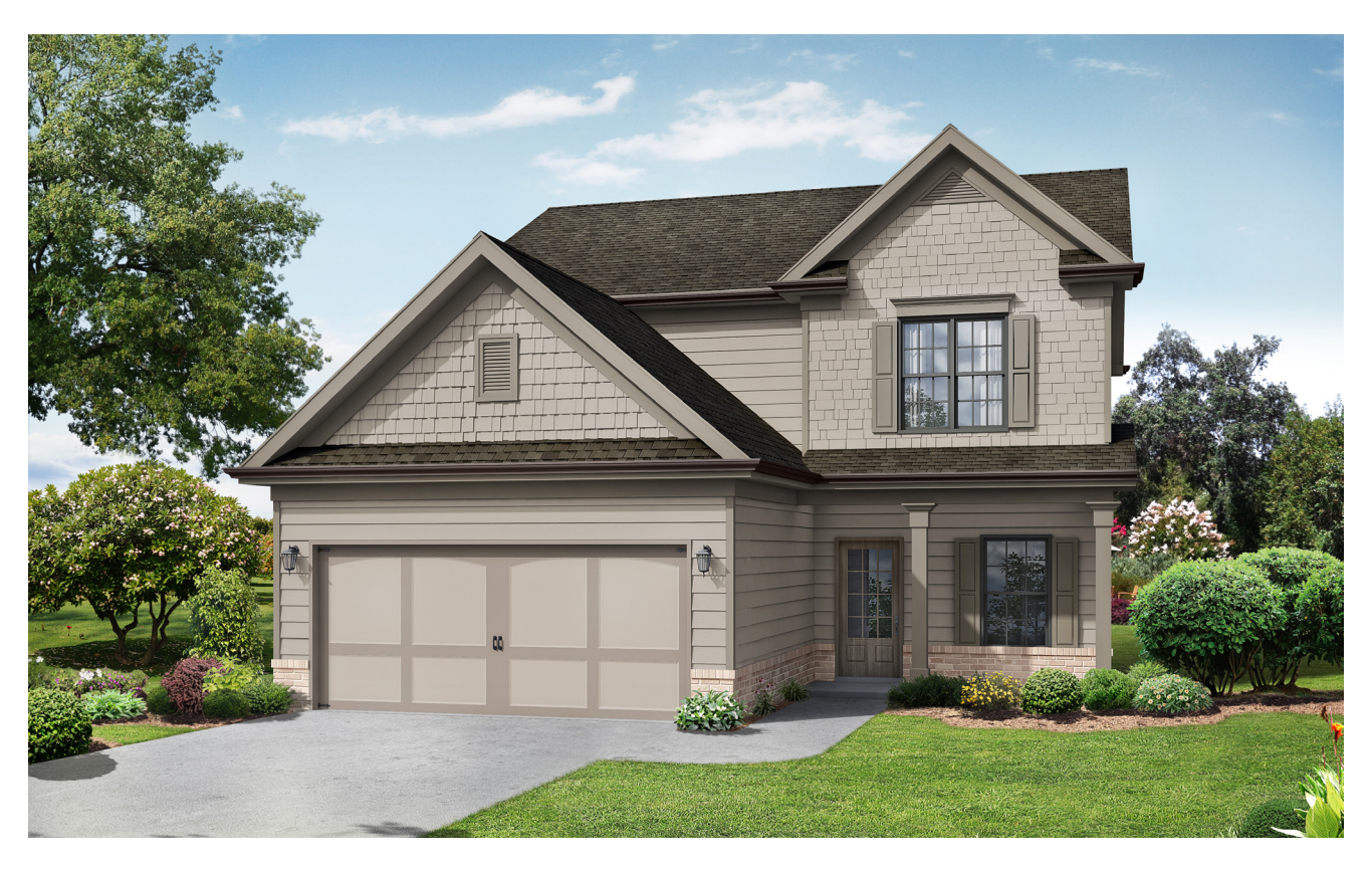
Elevation A (Standard)