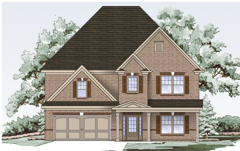
Optional Elevation B

Subject to errors, omissions and changes without notice. All is believed to be accurate, but is not warranted. Renderings and plans are for illustration purposes only and may include additions, options or modifications not part of our standard offering, and are subject to change without notice. Business is done in accordance with federal fair housing laws. Sales and Marketing by Tamra Wade and Partners.