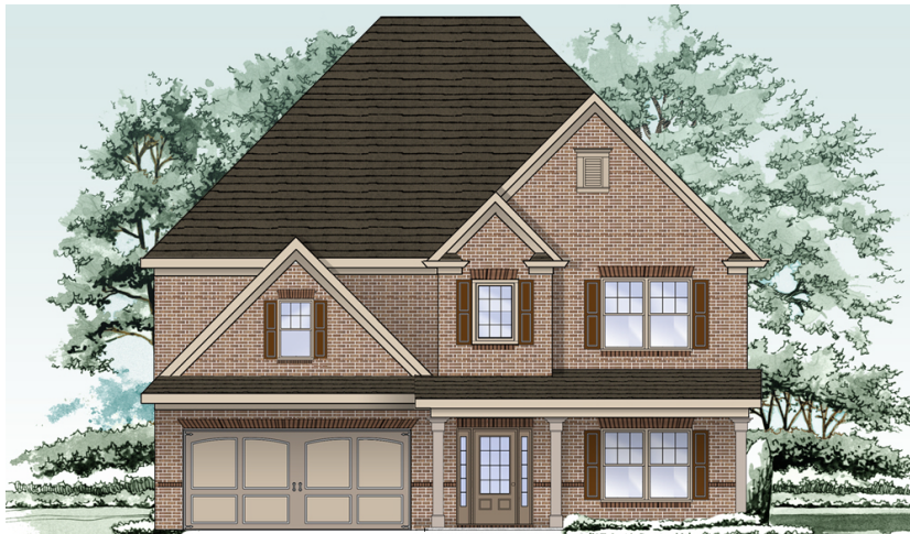
Elevation A = Standard