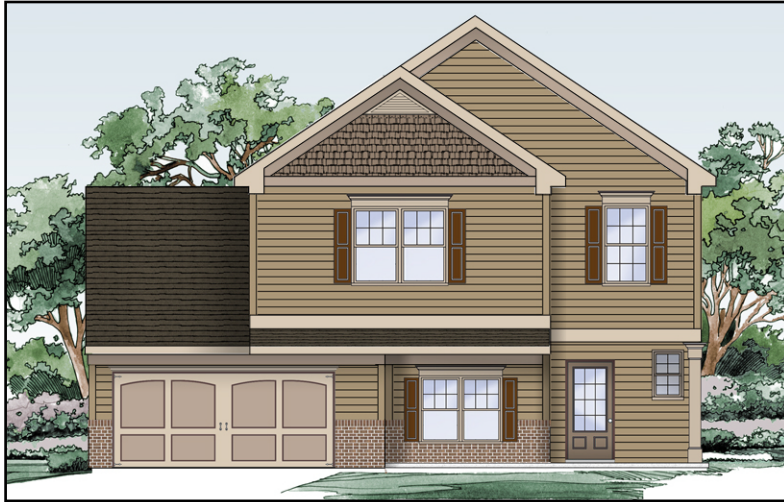
FRANKLIN II A